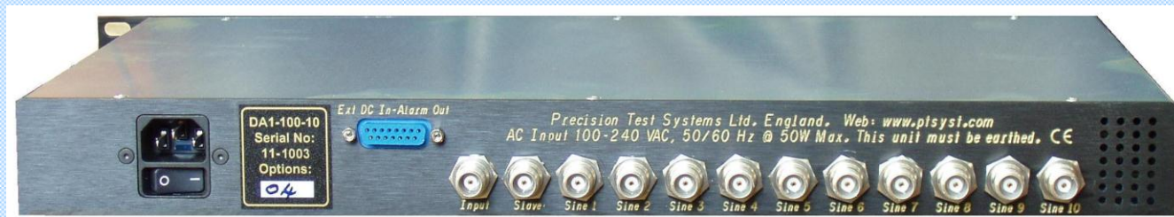
DA1-100-10 Rear view (with option 04 TNC Connectors).

Precision Test Systems also manufactures the PTS50 and DA1010 series of distribution amplifiers. These models are lower cost alternatives to the DA1-100-10 but still give very good performance.