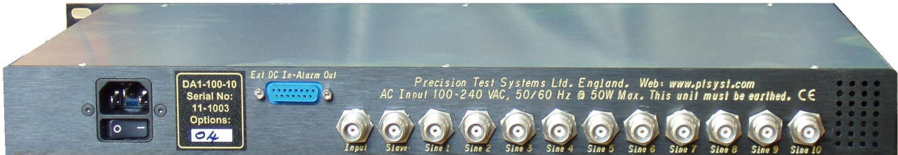
DA1-100-10 Rear view (with option 04 TNC Connectors).

Precision Test Systems also manufactures the PTS50 and DA1010 series of distribution amplifiers. These models are lower cost alternatives to the DA1-100-10 but still give very good performance.